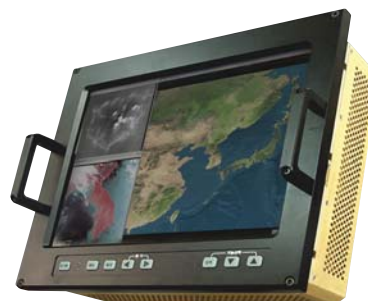
Military use, two sided, special sizes (6.2", 7", 17")