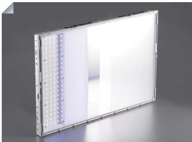
LED of direct type