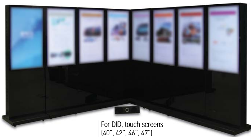
For DID, touch screens (40", 42", 46", 47")