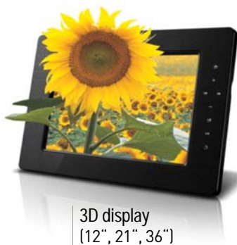
3D display (12", 21", 36")