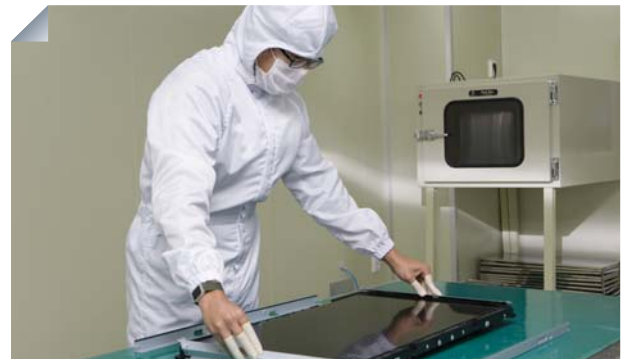
BLU testing line