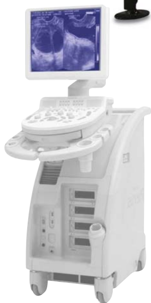
Medical use (14", 15", 17")