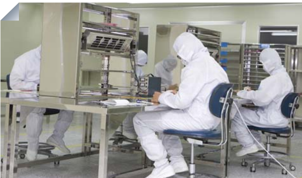
BLU assembly line